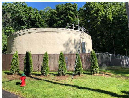
The DeWitt Drive Water Storage Tank refurbished in 2018.