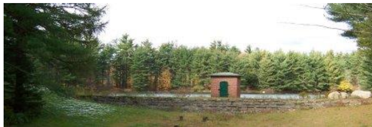
Bristol Water Department Reservoir in the Town of Plymouth.